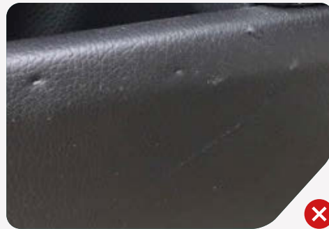
Holes to the interior upholstery and trim and not acceptable.