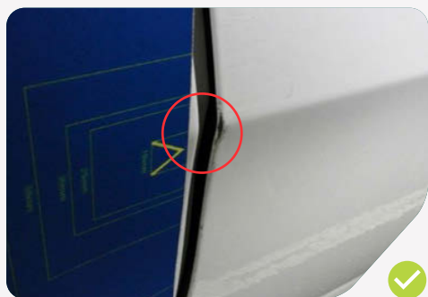
Small areas of chipping, including door edge chipping, are acceptable.