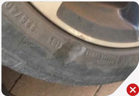
Tyre sidewall damage is not acceptable.