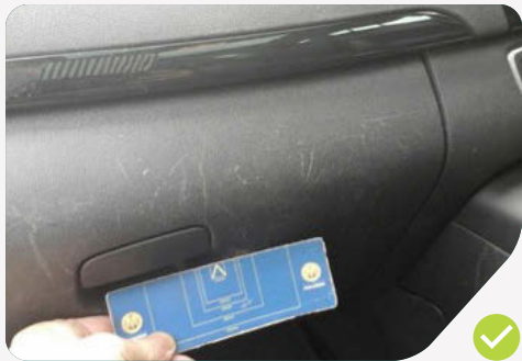
Scratches that reflect normal use are acceptable.