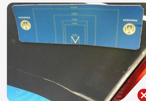
Any scratch where the primer or base metal is shown will also be charged.

Black and white striped boards (zebra boards) are often reflected in the body panel. The stripes distort when there is a dent on the panel making it easier to see in a photograph.