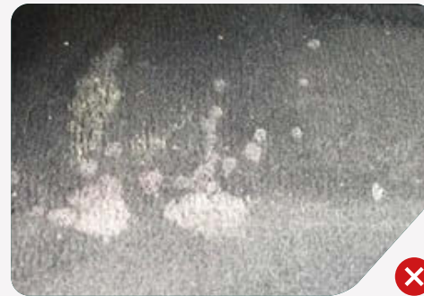
The interior of the vehicle must be clean and odourless with no burns, scratches, tears, dents or staining.