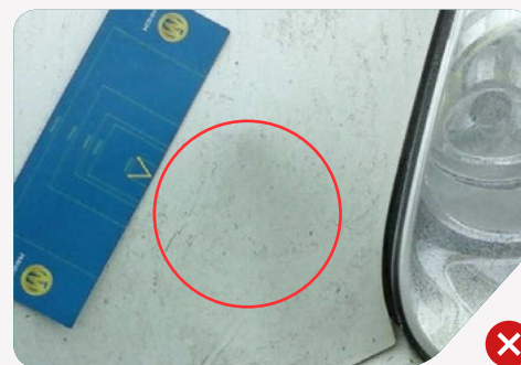
Dents over 15mm in diameter, or any dents to the roof or swage line on any panels, are not acceptable.